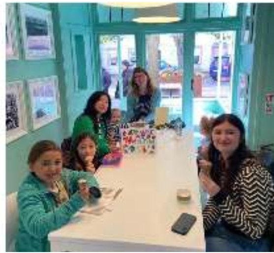
Mountain Day in St Andrews