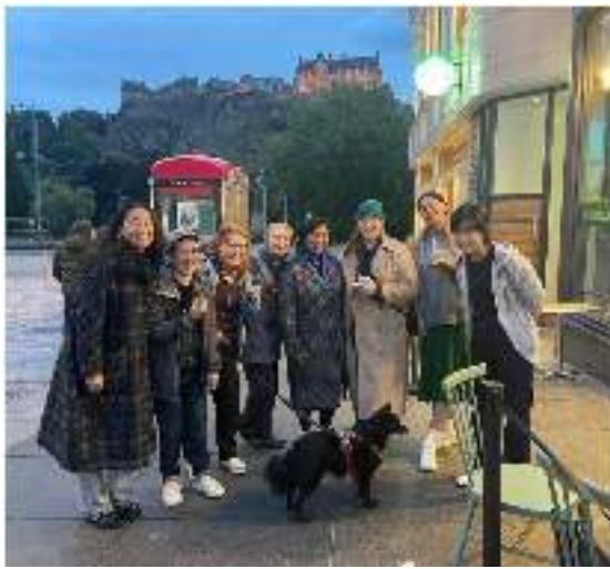
Mountain Day in Edinburgh